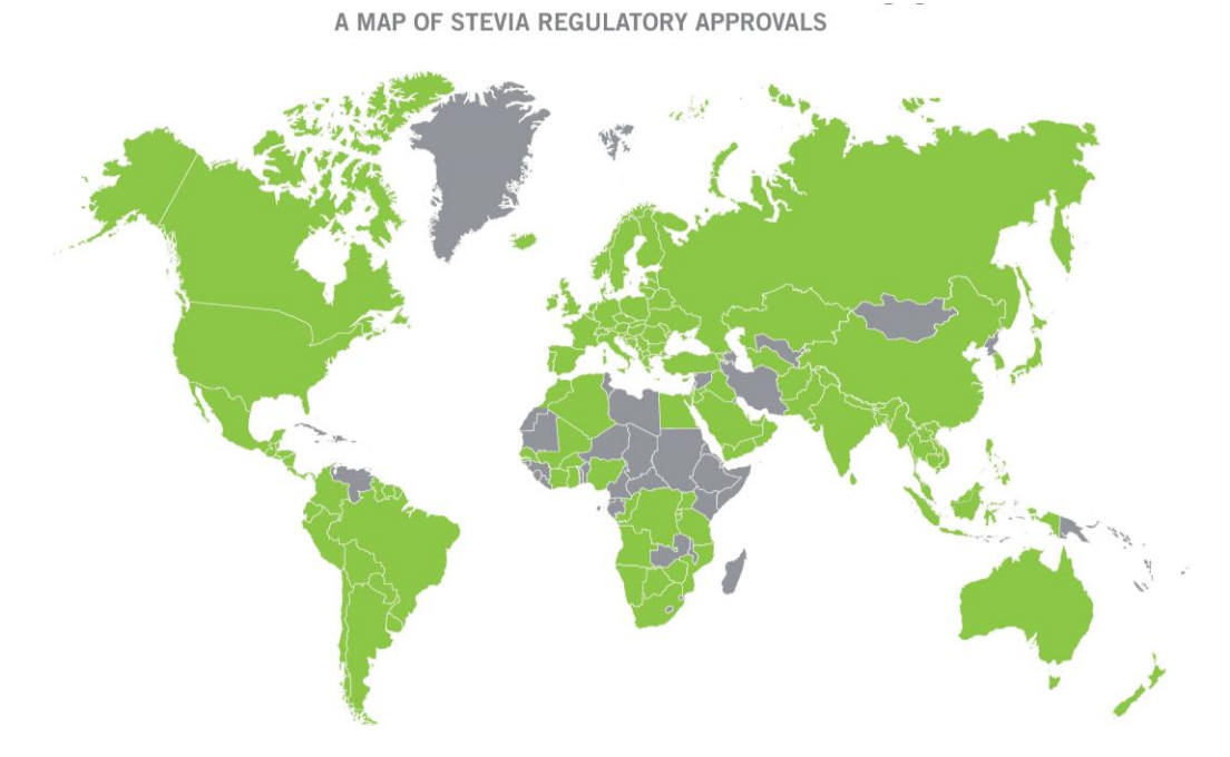
Figure 2. Map showing the counties in which stevia is approved as a sweetener (Global Stevia Institute, 2016).

As of December 31, 2016, countries representing over 75% of the global population had approved the use of stevia extracts in food and beverages (Figure 2).