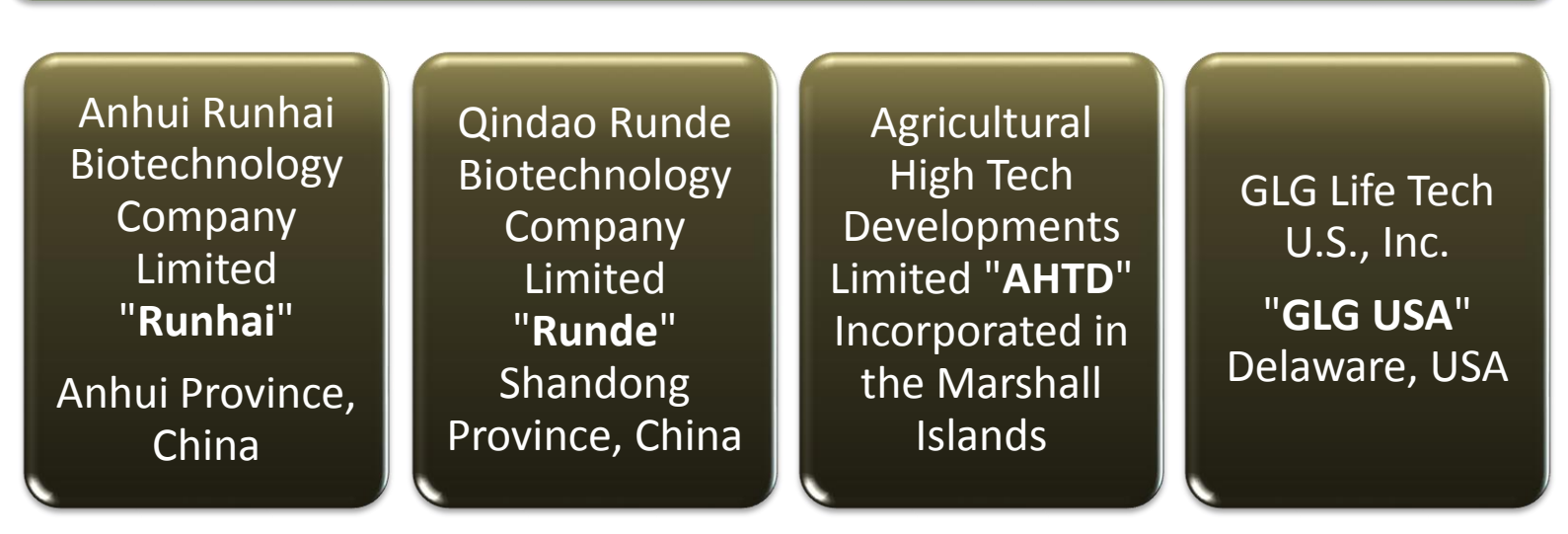
Figure 1 – GLG Life Tech Corporation and its subsidiaries (GLG owns 100% of each of these subsidiaries except Runhai, where it owns a controlling interest).

Anhui Runhai Biotechnology Company Limited ("Runhai") was formerly named Chuzhou Runhai Stevia High Tech Company Limited and originally consisted of a single facility ("Chuzhou Runhai"), established in September 2007, for the purpose of processing stevia leaf grown and harvested in the Mingguang region of China. In 2016, three other wholly-owned foreign subsidiaries – Dongtai Runyang Stevia High Tech Company Limited ("Runyang"), Qingdao Runhao Stevia High Tech Company Limited ("Runhao"), and Anhui Bengbu HN Stevia High Tech Development Company Limited ("Bengbu") – were amalgamated with Runhai, and in 2017 Runhai became a Joint Stock Company under Chinese law.